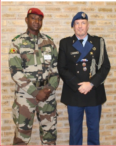
The Malian Officer and the Netherlands Military Attaché both lost their immediate family members while on the course. The CEMIS team would like to extend its deepest condolences to their families, may the grace of God keep their families united in this difficult time.