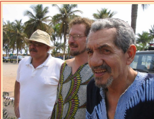
During a visit to Angola in 2007, one of the editors with Lucio Lara, leading figure of the liberation movement, MPLA, in the town of Tsumbe